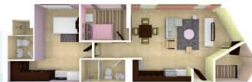
2 BEDROOM PREMIERE 74 SQM