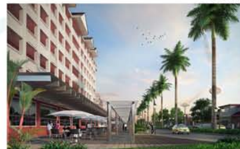
Da Vinci Commercial Area

Presidio gives you convenience right at your doorstep with various commercial spaces that will cater to every taste and lifestyle need. Carefully selected to provide only the best for its residents, shops, dining and entertainment outlets at Presidio are sure to excite residents and their family.