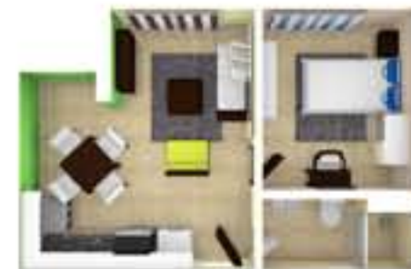
1 BEDROOM 37 SQM