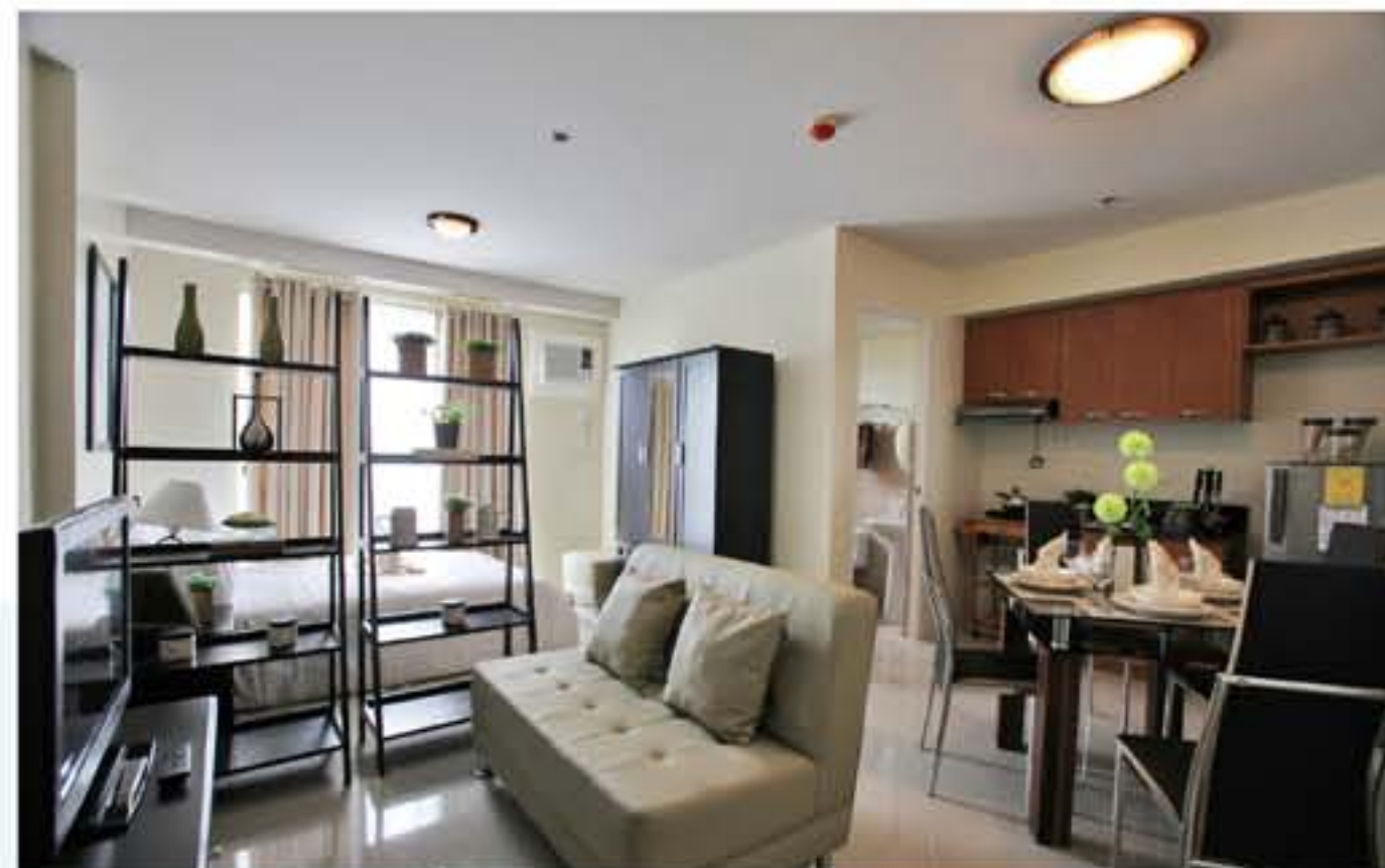
Fully-furnished studio unit.

Interior-designed condo units combining convenience, functionality, comfort and tasteful artistry that comes with modern and stylish furniture and most up-to-date appliances. It's like living in your own hotel suite.