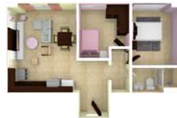
2 BEDROOM 51 SQM